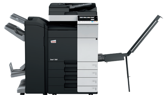
ineo+ 368 with dual scan document feeder (DF-704), staple/booklet finisher (FS-534SD), banner tray (BT-C1e) and paper feeder (PC-210)