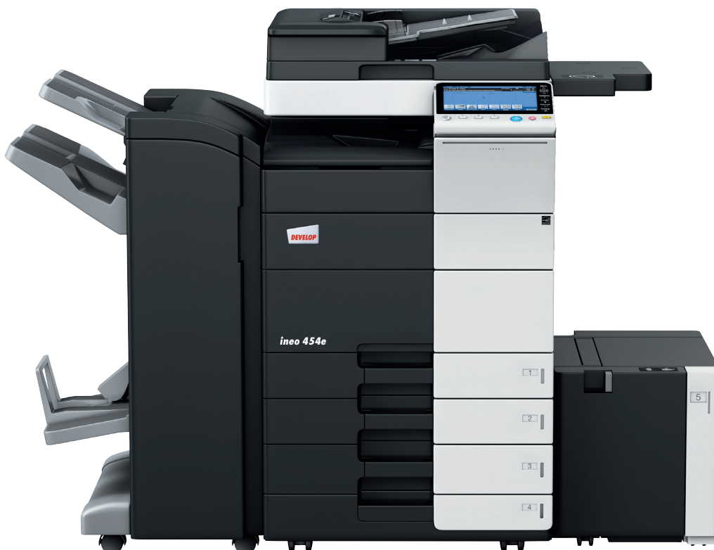
ineo 454e with staple/booklet finisher (FS-534SD), paper feeder (PC-210), large capacity tray (LU-301) and working table (WT-506)

Each of these multifunctional office devices – the ineo 224e, ineo 284e, the ineo 364e, the ineo 454e and the ineo 554e – is not only remarkably easy to use but also offers a wide variety of features to facilitate everyday office tasks. By saving office users time in printing, copying or scanning, they can return to their normal work faster. And that will ultimately help boost productivity.